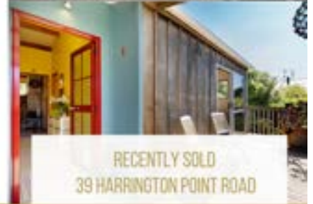
RECENTLY SOLD 39 HARRINGTON POINT ROAD