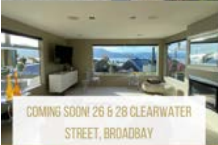
COMING SOON! 26 & 28 CLEARWATER STREET, BROADBAY

2019-2020, 2020-2021 & 2021-2022 SALES PERSON OF THE YEAR